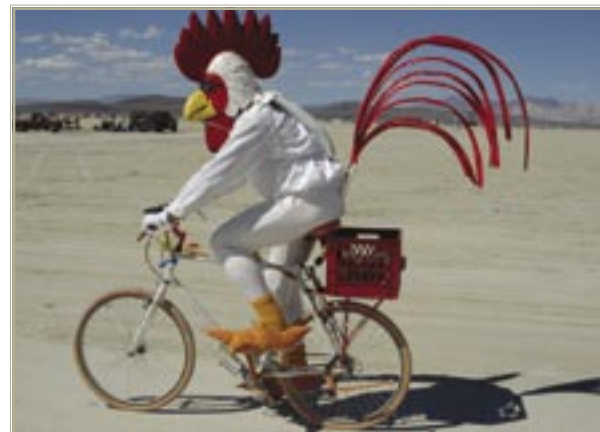
THE BIG COCK ON A BIKE

There will be no Bike CampinCenterCamp. We are encouraging all bike mechanics in Black Rock City to share resources and information among themselves to enable all pedal powered citizens to be self reliant. To this end we have created the Bike Mechanics' Guild; anyone with expertise on bike repair is automatically a part of an informal network. If you are