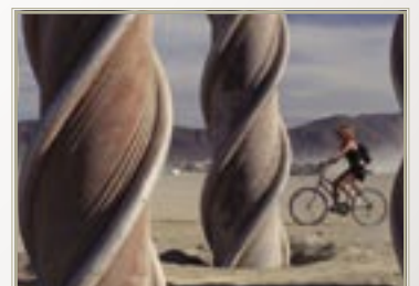
PARTICIPANT REFLECTIONS P 6