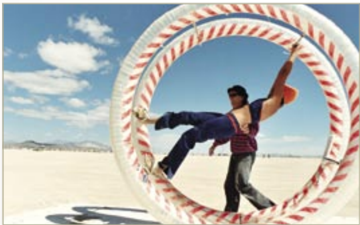
HAMSTER WHEEL