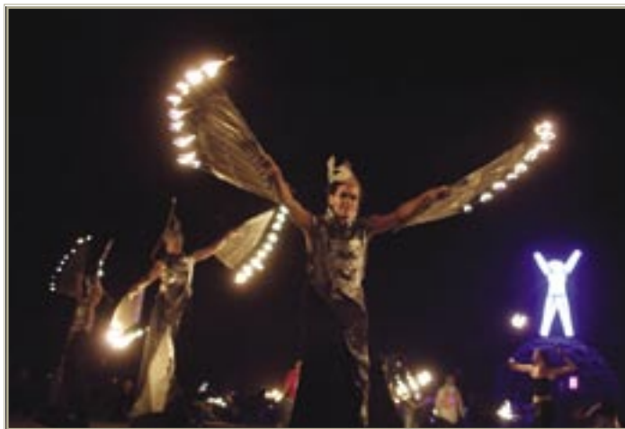
BRITISH COLUMBIA'S BIRDZ O' PARADISE PERFORMANCE GROUP

The next morning before dawn, I set out for the Temple of Stars. I got there when the shadows were still long, and listened to Tibetan Bowl Bells. I walked up on the platform, and read many memorials. I stayed there quite a while. Then I fixed my mom and dad's images to the Temple, and walked away. I stood on the spot