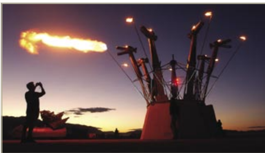
DRAGONS OF EDEN BY LUCY HOSKINGS

All mutant vehicles must be pre-registered; all mutant vehicles must display their DMV placard. For information on what qualifies as a mutant vehicle, to register your work of art or your handicap vehicle contact dmv@burningman.com and visit dmv.burningman.com .