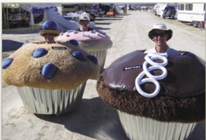
THE ROVING CUPCAKES.

Stooping down in order to retrieve a cigarette butt from the desert floor might not appear to be a liberating act - especially if it is someone else's cigarette butt. But giving and receiving soulful gifts, many of them imparted by strangers, has a way of making people feel that they belong to Black Rock City as participants, as members of a culture that we share. Pack it in and Pack it out and Leave No Trace are slogans. But veteran participants internalize these values as a form of radical responsibility. They are self-expressive, self-reliant, self-policing: self-aware. They create art and respect the art of others. They volunteer as greeters, Lamplighters, Rangers, recyclers, and theme campers. They leave their campsites as they found them: completely bare, without a single lasting trace that they were there. They freely do these things, few of