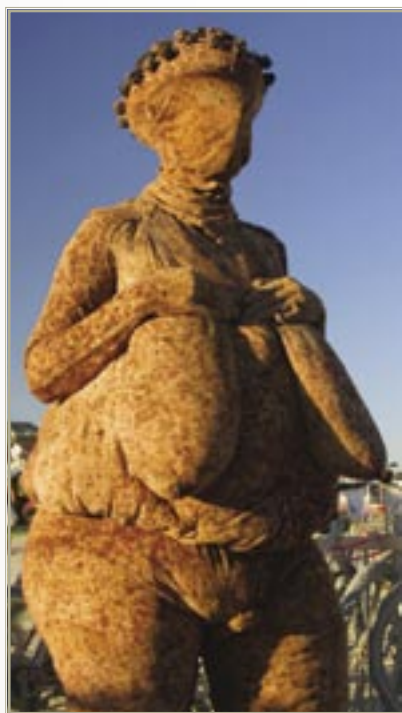
VENUS OF WILLENDORF

ANSWERS 1.1998 2.Baltimore/Washington 3.Hawaii 4.Los Angeles 5.Colorado 6.Sun Valley 7.Tokyo 8.Kansas City/St. Louis 9.Vancouver, Victoria, Edmonton, Calgary, Winnipeg, Toronto, Ottawa, Montreal, Nova Scotia 10.Florida 11.Coney Island 12.Spain 13.Thailand 14.KiwiBurn 15.Arizona 16.5.North Bay, South Bay, Sacramento, Silicon Valley, Santa Cruz 17.Three Sided Whole