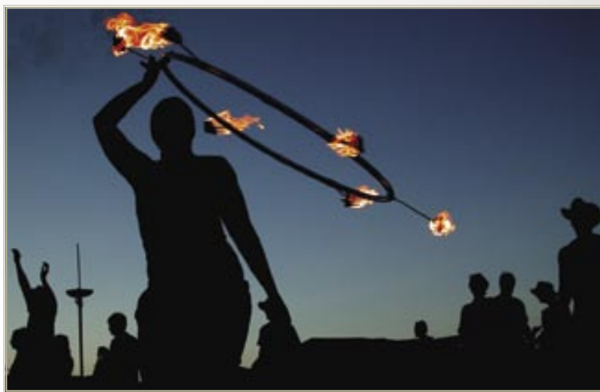
FIRE HOOPER

Immediate experience is, in many ways, the most important touchstone of value in our culture. We seek to overcome barriers that stand between us and a recognition of our inner selves, the reality of those around us, participation in society, and contact with a natural world exceeding human powers. No idea can substitute for this experience.