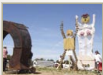
THE OTHER 51 WEEKS P 2