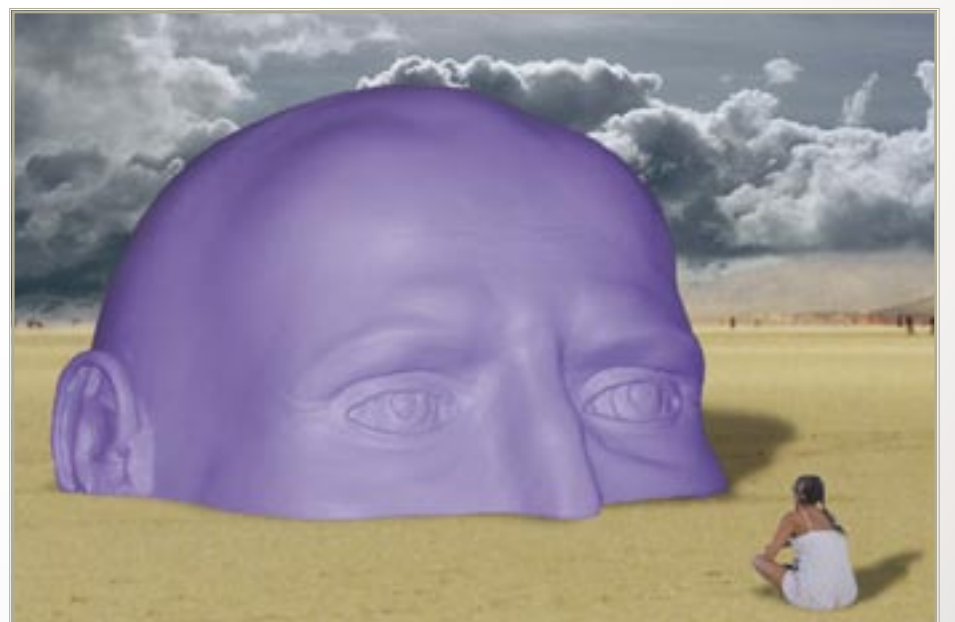
THE DREAMER BY PEPE OZAN RENDERING BY PAUL GUTOSKI