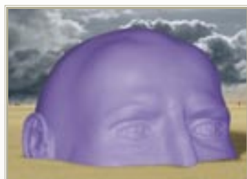
2005 THEME P 4