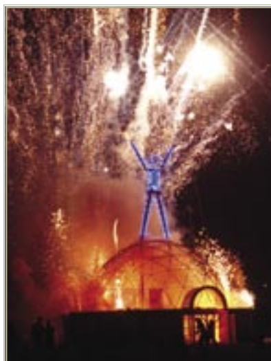
THE BURN