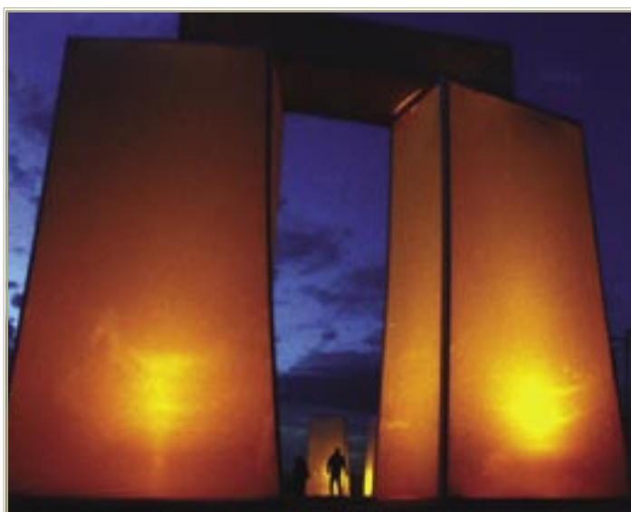
SOL HENGE BY SOL SYSTEM

Seattle's Burning Man community will join together to create this prodigious piece, and the community of Black Rock City will supply the energy that brings the Brobdingnagian device to life. The week's activities around The Machine will culminate in a 30-minute performance featuring fire performers, stilt-walkers, acro-balancers, drummers, and musicians. At