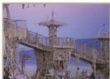
A FOUNDATION FOR COMMUNITY P 3