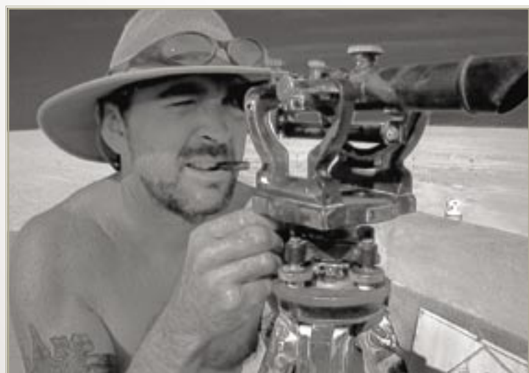
COYOTE SURVEYS THE PLAYA

If you would like to learn more about what Burning Man does to protect the environment and what you can do to help, please visit the environmental section of our website: www.burningman.com/preparation/event_survival/protecting_the_environment.html or search the site under Environment.