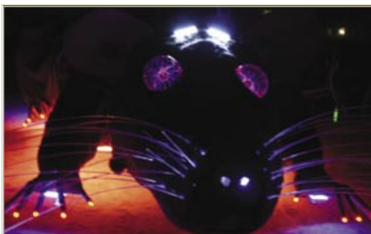
RAT CAR

Every year the organization faces a tremendous task of picking up participants' abandoned trash on the asphalt roadway between the Gates of BRC and I-80. As you prepare for the event please eliminate all unnecessary items that are potential trash. Upon departure from BRC secure your trash and dispose of it properly at a landfill on your way home. Please do not dump your trash on the side of the road! Thank you.