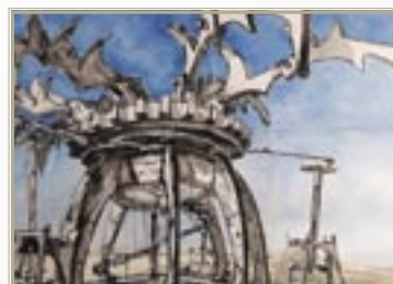
BURNING MAN ART P 5