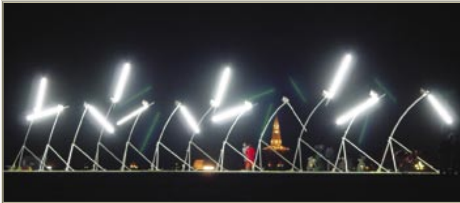
ALIEN SEMAPHORE BY HEDLEY DAVIS

groups will take responsibility for its cauldron on the playa and participate in the overall construction of the sculpture. This installation will create, in Smith's words, "a central space ('synapse') where all of the participants from around the country will get to know each other as they tend the sculpture during its nightly firings."