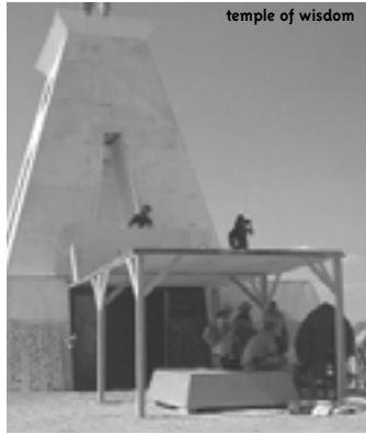
temple of wisdom